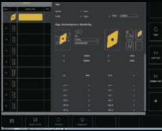
Multi-Platform Web-Based HMI (Fully Customizable) (Win, Android, iOS, Linux)

CNC 8065. A Flagship Control System without any technical limitations. Powered with a multi-processor Quadcore platform and adaptable to all modern Web-Based HMI's - hence delivering complete portability to your production floor. AI-based machine learning algorithms, Data capture & analysis , Online CNC support including training, tuning, troubleshooting, & feature updates. Included is an advanced library of technical tools such as DMC, HSSA, FFC, & Open System to assist with any complex operation.