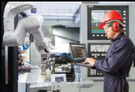
Easy Interface with Automation Devices (Loaders, Pick & Place, Guaging Devices, etc.)