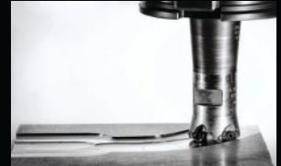
High-Speed Surface Accuracy (HSSA)