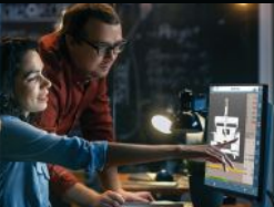
Powerful Free Online Tools (Remote CNC Support, CNC Simulator, YouTube Tutorials)