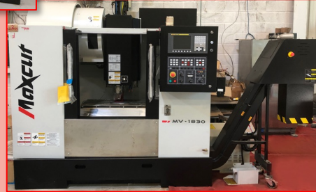
MV-1830 with CAT#40 30" x 18" x 20" X/Y/Z-axis