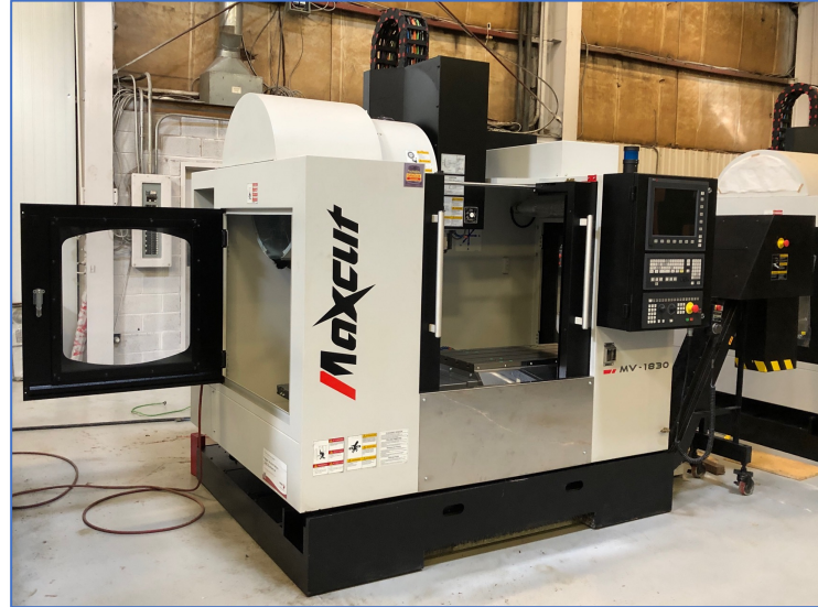
open left side door / open double front doors