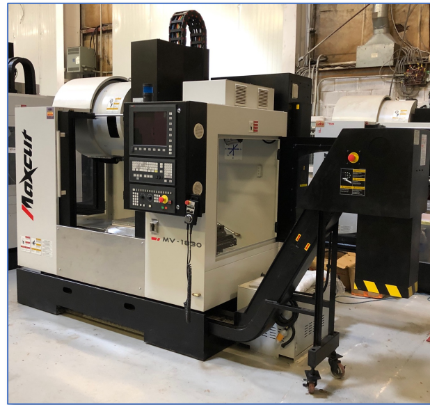
open right side door / open double front doors