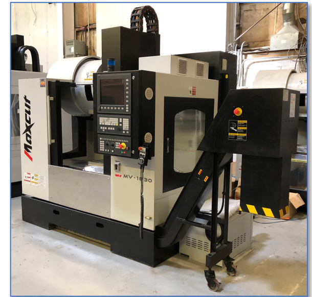
closed right side door / open double front doors