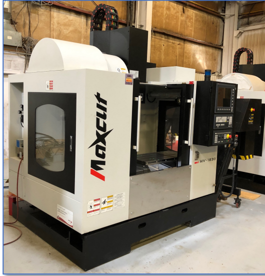
closed left side door / open double front doors