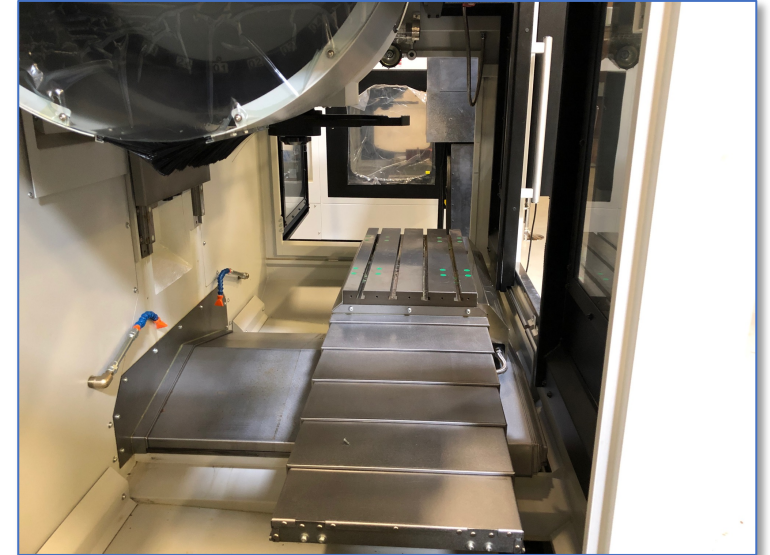
open left side door access